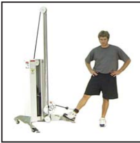
Standing Gracilis - Internal Rotation - Adduction - Slight Flexion