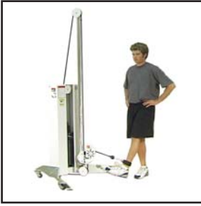
Standing Glute Medius - Posterior - Abduction - External Rotation